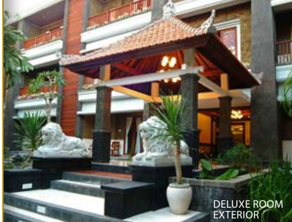
DELUXE ROOM EXTERIOR

American Express, Visa, MasterCard, Diners Club